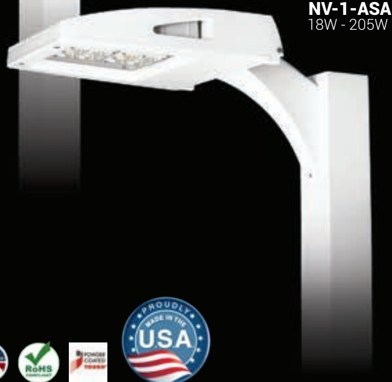
NV-1-ASA 18W - 205W