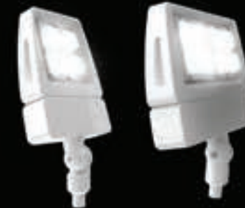
NVF-2 50W - 80W