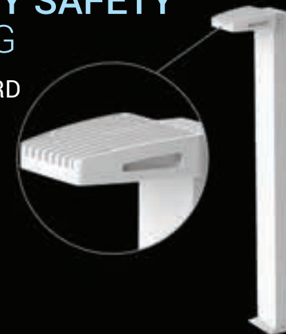
NV-BOLLARD 20W - 45W