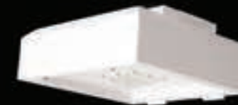
VSS-S-CM 18W - 106W