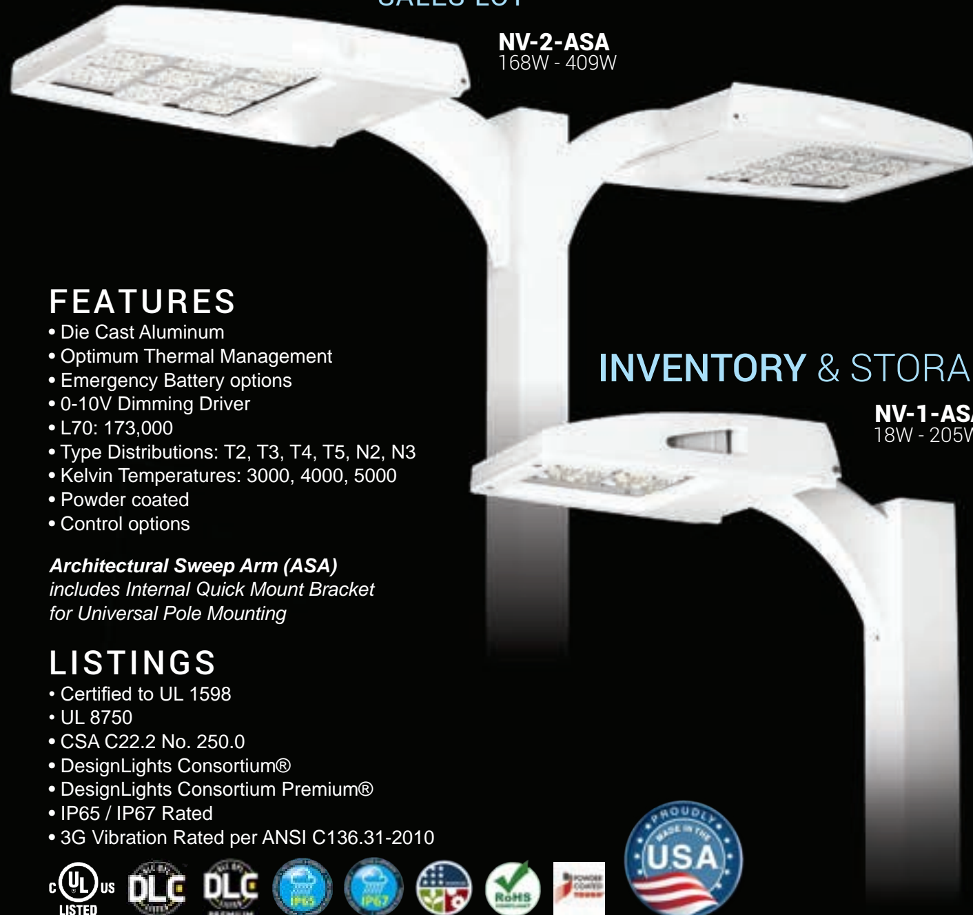
NV-2-ASA 168W - 409W