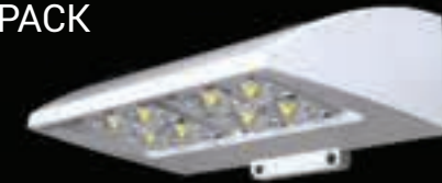
NV-WALL PACK 19W - 100W